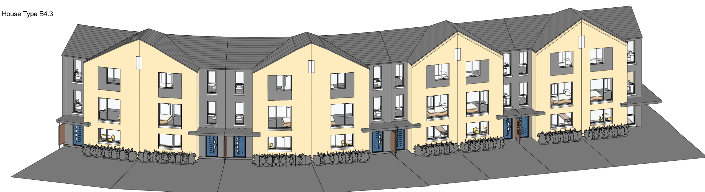
4 Block 2- 3D View